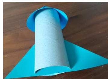
7) Push the triangle up to make fins