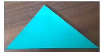
4) Cut out a triangle