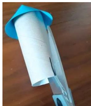
6) Cut along both lines