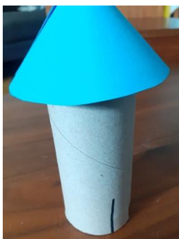
5) Draw this line on both sides