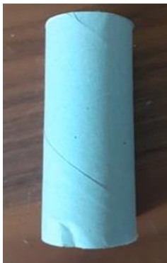
1) Find a toilet roll tube

You will need: -a toilet roll tube – paper – glue – colours – scissors