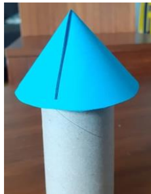
3) Fold into a cone and stick