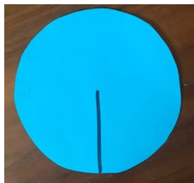
2) Cut out a circle and cut along the line to the middle